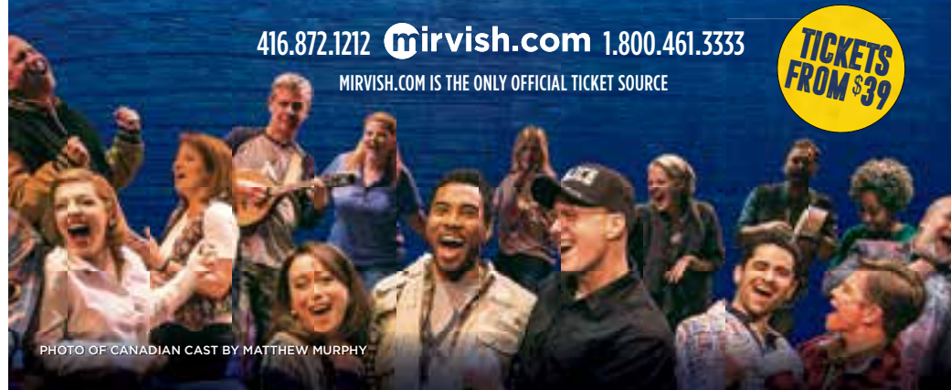
PHOTO OF CANADIAN CAST